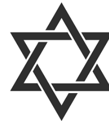
Star of David