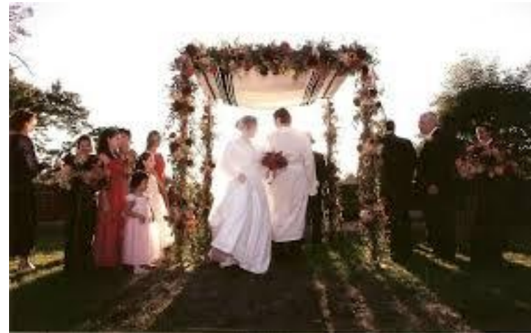
A Jewish wedding under a special canopy called a chupa