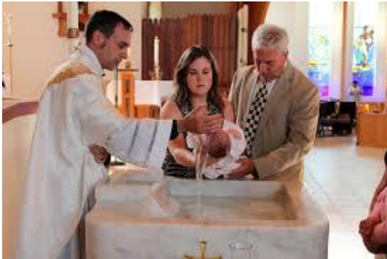
Baptism – a Christian naming ceremony