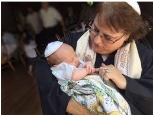
brit bat – a Jewish naming ceremony for girls brit ben – a Jewish naming ceremony for boys