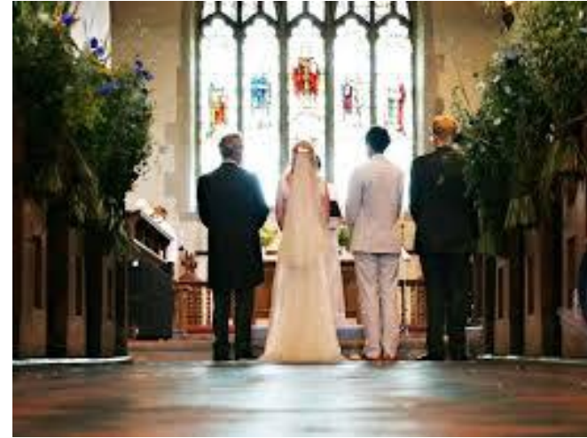
A Christian wedding in a church