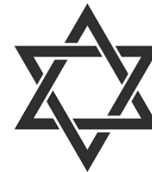
Star of David