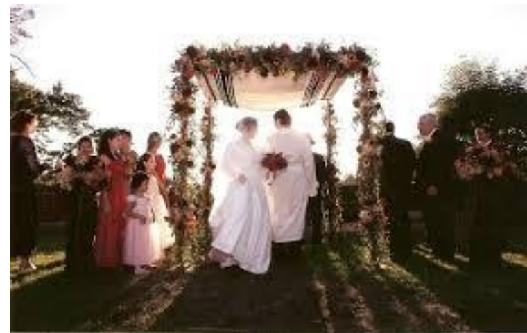
A Jewish wedding under a special canopy called a chupa